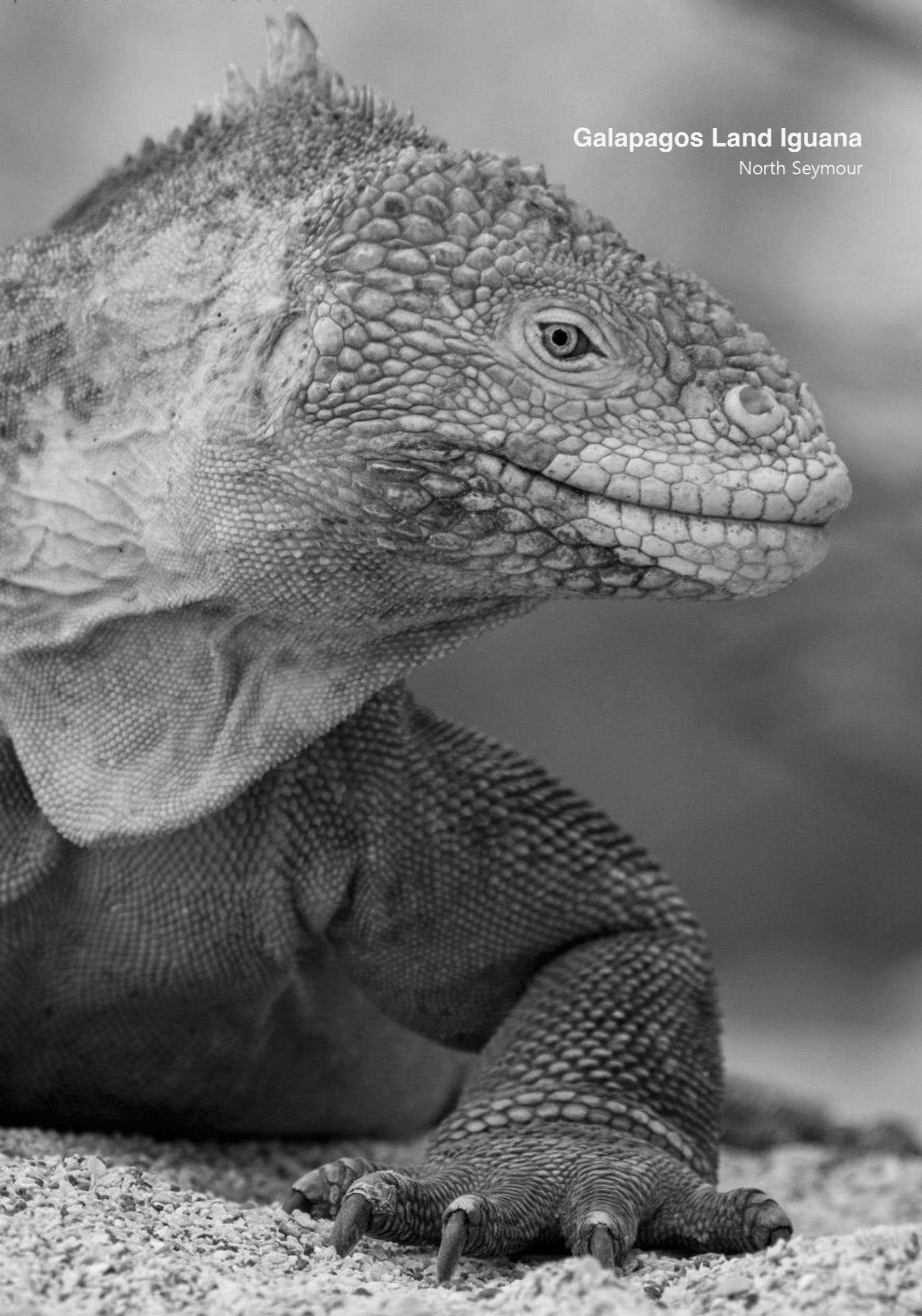
Galapagos Land Iguana North Seymour